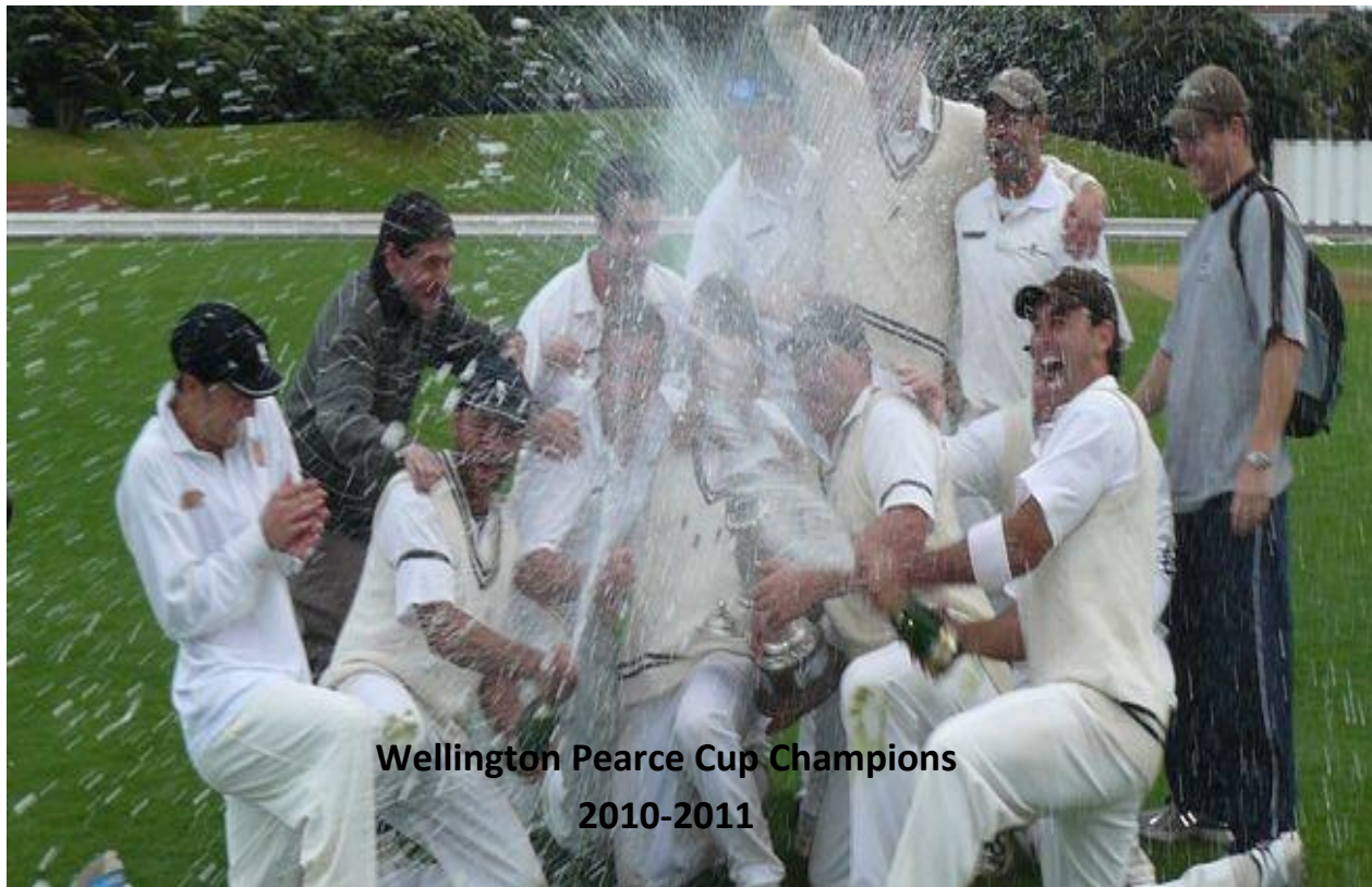
Wellington Pearce Cup Champions 2010-2011